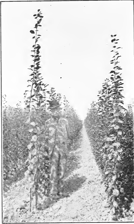
1-Year Prune Trees in Nursery Rows